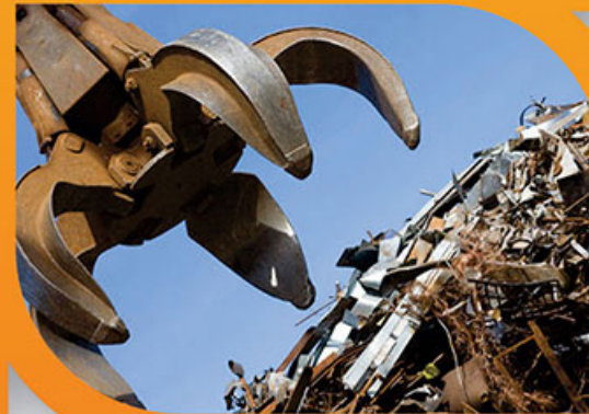
PURCHASING AND TRADING OF SCRAP