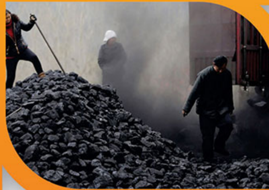
DOMESTIC COAL AND IMPORTED COAL TESTING