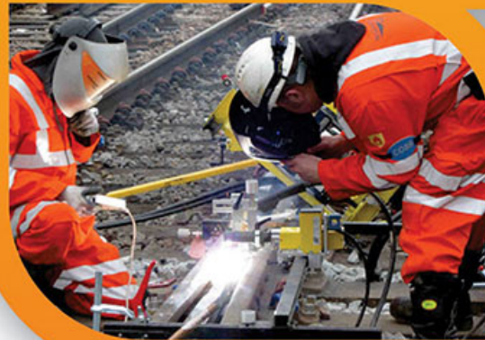
RAILWAY TRACK MAINTENANCE