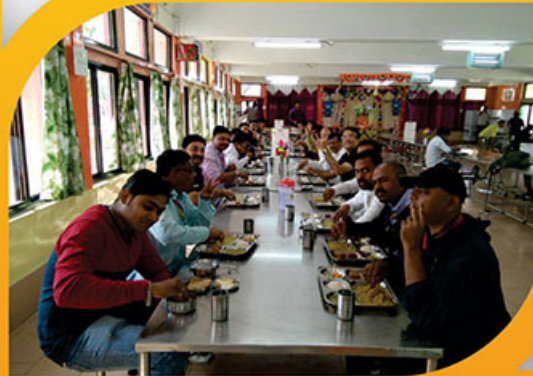
PLANT CANTEN SERVICES