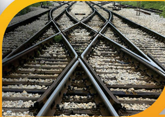
LIAISONING WITH ALL RAILWAY DIVISIONS