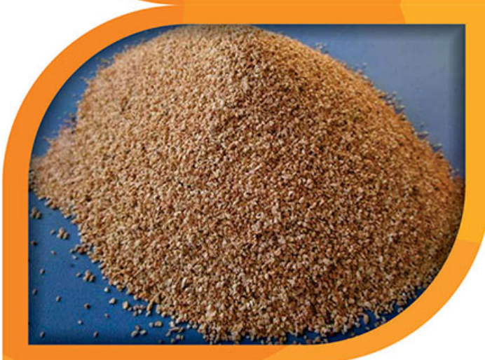
Boiler Bed Material