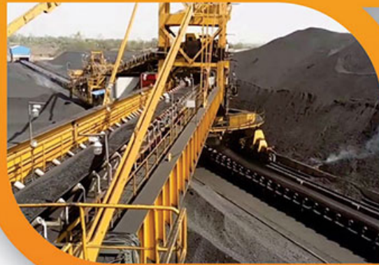
PLANT OPERATION AND HANDLING OF CHP COAL