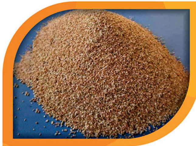
Boiler Bed Material