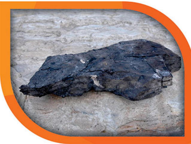
Lignite coal, bituminous coal & other varieties