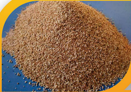
BOILER BED MATERIAL AND REFRACTORY ITEMS