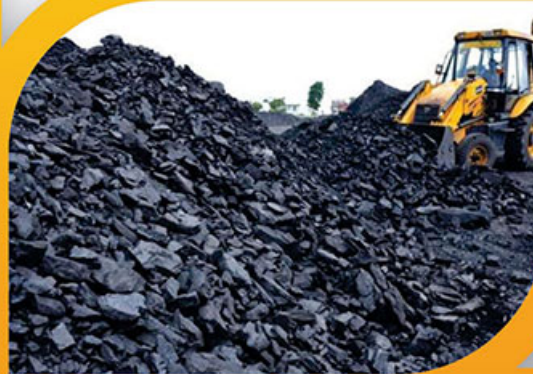
IMPORTED COAL TRADING, HANDLING AND LIAISON WITH CUSTOM AUTHORITIES