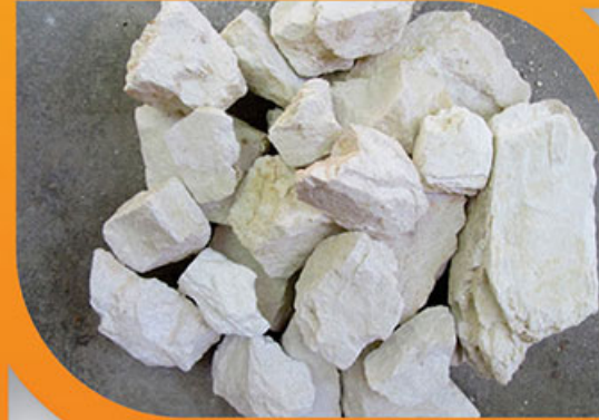
LIMESTONE AND FELDSPAR TRADING