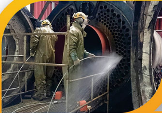
PLANT HOUSE KEEPING