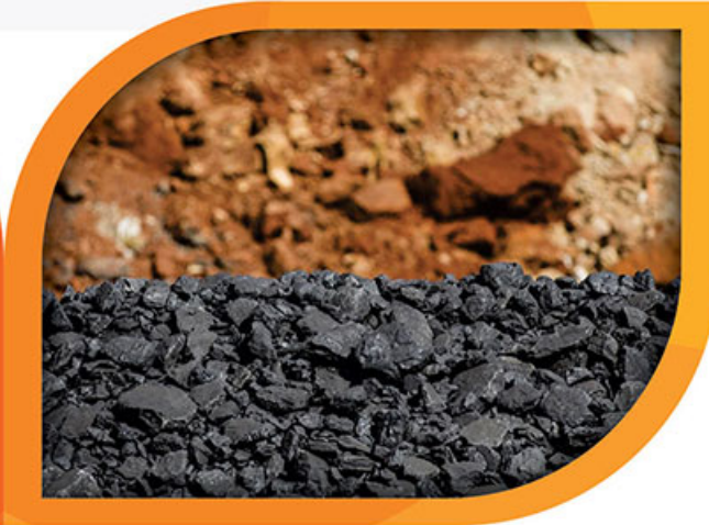
South African Coal