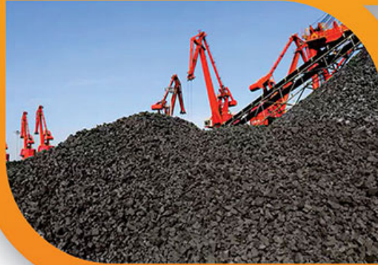
HANDLING OF DOMESTIC COAL FSA COAL